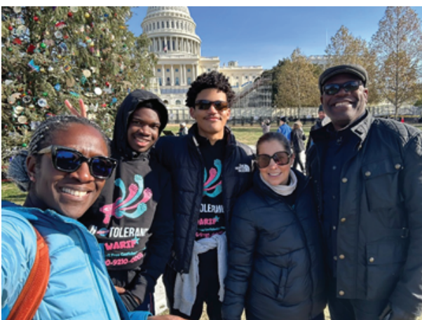
WASHINGTON D.C., UNITED STATES OF AMERICA