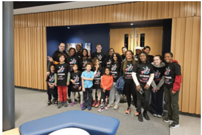
MINNESOTA, UNITED STATES OF AMERICA