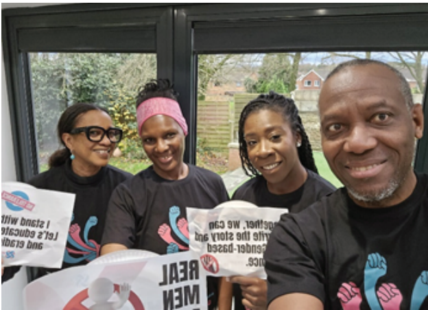
MANCHESTER, UNITED KINGDOM