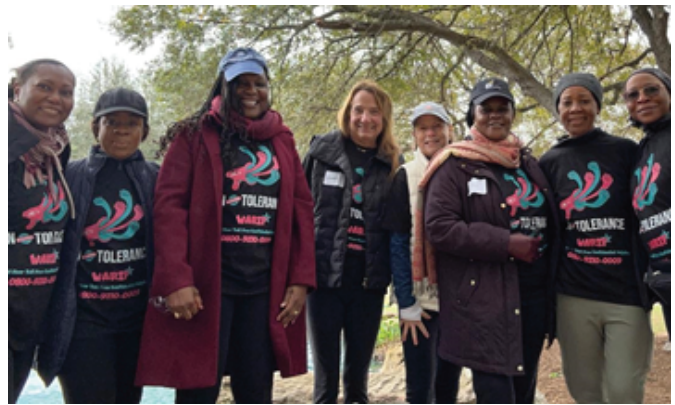
HOUSTON, UNITED STATES OF AMERICA