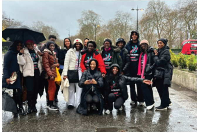
LONDON, UNITED KINGDOM