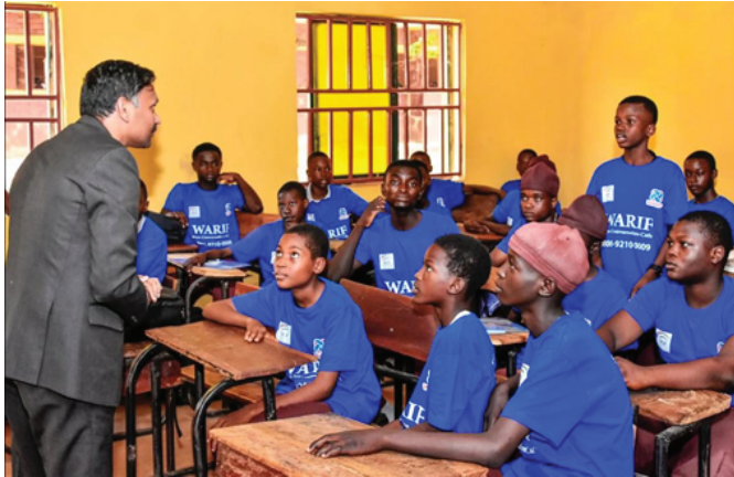
G.S.S Pupil, Nyanya, Abuja and T.C.F Rep

In a powerful collaboration with the Tulsi Chanrai Foundation , WARIF recently implemented an impactful program with adolescent boys at Government Secondary School, Nyanya, as part of our WARIF Boys Conversation initiative. This enlightening training equips adolescent boys with a deeper understanding of the severe trauma caused by rape and sexual violence, shedding light on the silence, guilt, and shame that often surround these issues. During the sessions, the boys were encouraged to reflect on the profound consequences of gender-based violence, both on the survivors and on society. The conversations focused on breaking down harmful stereotypes and misconceptions while highlighting the crucial