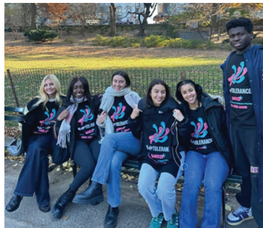
NEW YORK, UNITED STATES OF AMERICA