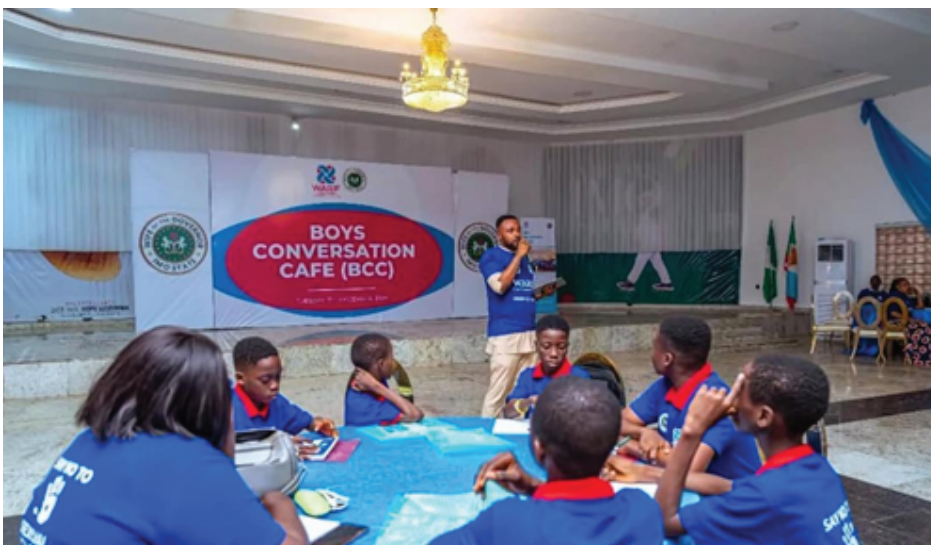
WARIF Boys Conversation Cafe

Women and girls continue to bear the brunt of gender-based violence and systemic abuse, experiencing devastating physical, emotional, and psychological trauma. This painful reality underscores the urgent need for concerted, collective action to both protect and empower them in the face of such violence. In response to this critical issue of gender based violence highlighted globally over the annual 16 Days of Activism; WARIF in partnership with the Office of the First Lady of Imo State Government, H.E Barrister Chioma D. Uzodimma implemented the WARIF Girl Project and the WARIF Boys Conversation Café in the state on 16 th and 17 th December 2024. Our well established and impactful adolescent school educational initiatives focused on raising awareness and educating young girls and boys about the far-reaching impacts of abuse, as well as effective strategies for its prevention and intervention, while challenging toxic masculinity, and cultivate a generation of males committed to creating a safer, more respectful society. It emphasized the irreplaceable role boys and young men play in combating gender-based violence and protecting vulnerable young girls and women through commitments to breaking the silence due to stigmatisation.