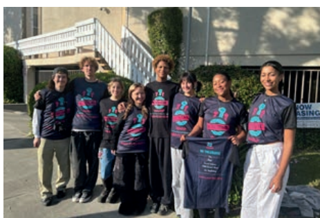
Los Angeles, United States of America