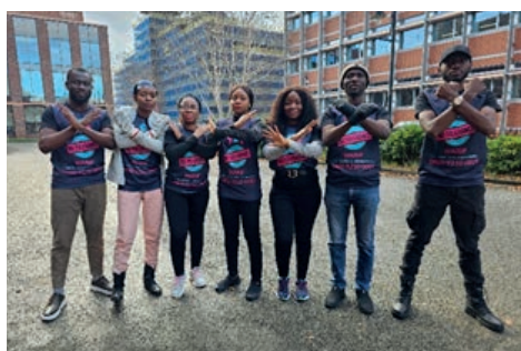
Liverpool, United Kingdom