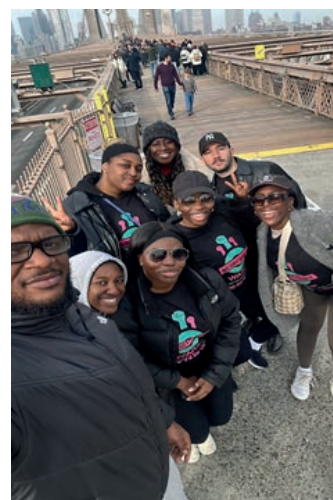
New York, United States of America