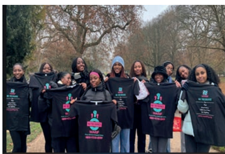
London, United Kingdom