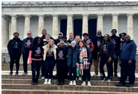
Washington D.C, United States of America